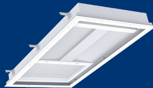
Architectural Design Type G