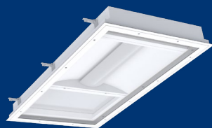
Standard Architectural Design Type F