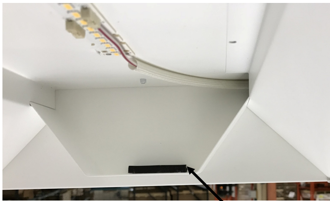
Gasket at each end

Viscor Inc. is not responsible for any injuries due to the improper installation or handling of its products.