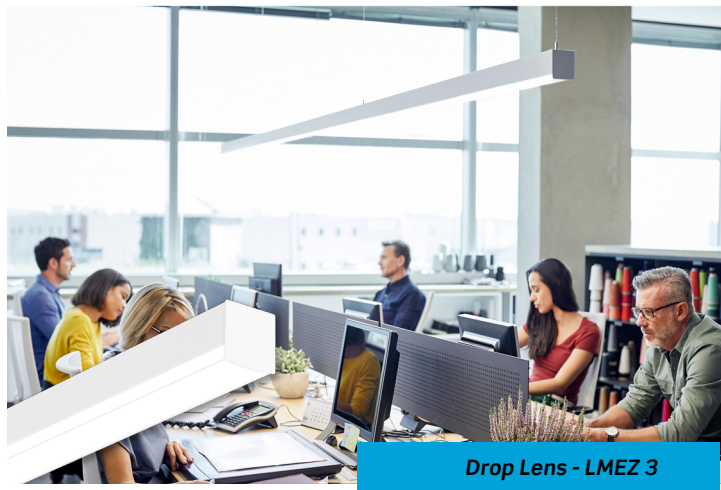
Drop Lens - LMEZ 3