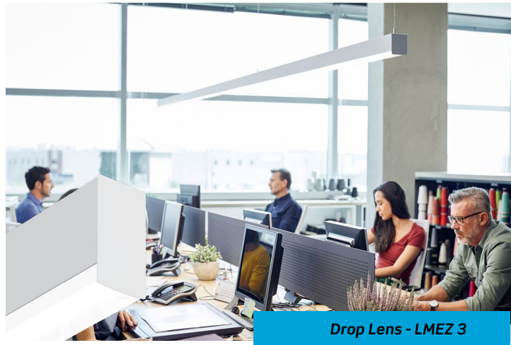
Drop Lens - LMEZ 3