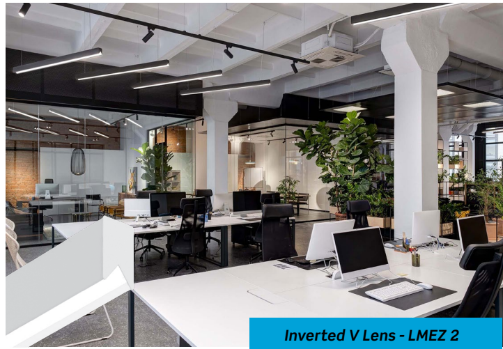
Inverted V Lens - LMEZ 2