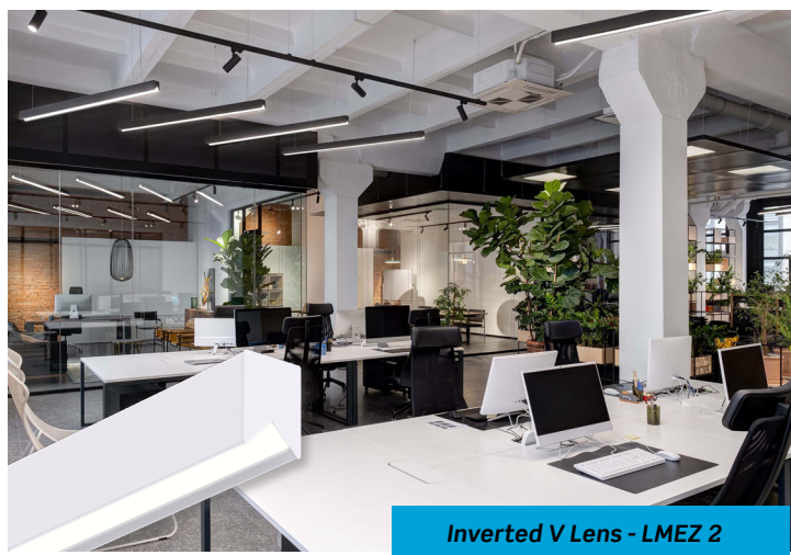
Inverted V Lens - LMEZ 2