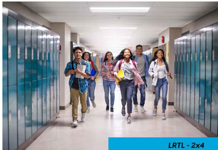
LRTL - 2x4