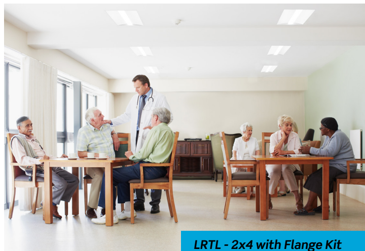
LRTL - 2x4 with Flange Kit