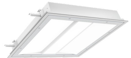
Available sizes: 2x2 | 2x4