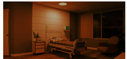
Night Observation Mode