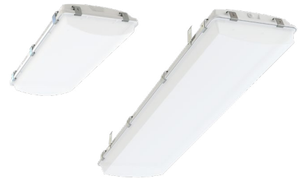
Optional P67 - Frosted high impact acrylic shown here

* Note: Fixture selection for classified hazardous locations are performed solely by professionals familiar with the application and hazard involved.