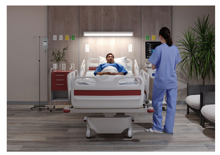
Low Glare Optical System