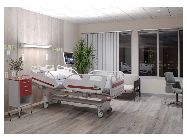
Multi-Function Headwall Luminaire