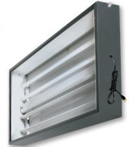
Single sided shown