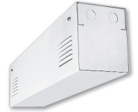
Vents shown only available on the BB3

Photometrics - Please consult www.viscor.com for photometric results.