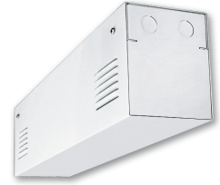
Vents shown only available on the BB3